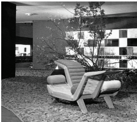
Charlotte Perriand's postwar furniture displayed in the exhibition Synthesis of the Arts, Takashimaya department store, Tokyo, 1955.

A pair of chaises will be arranged parallel to each other, in opposite directions, so the diners will face each other. This condition creates a bubble that frame close and daydream interac-tions. The chaise lounge resemblance a body lay down at the sun. Many restaurants have big windows, or in summer the windows are open; the restaurant is treated as an "outdoor" space (public, in the sense of open to the view) while being indoors (for weather reasons).