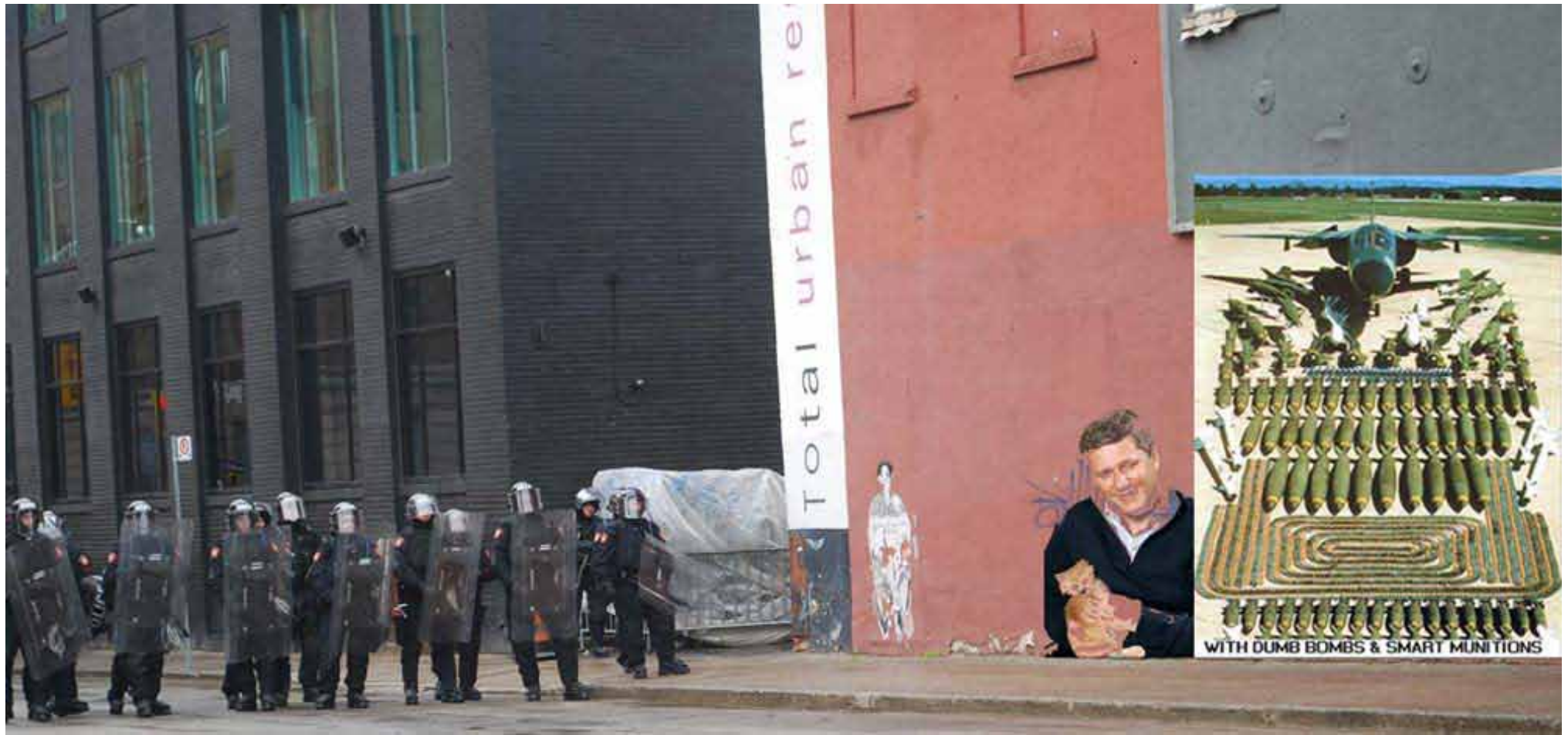
All around the mulberry bush