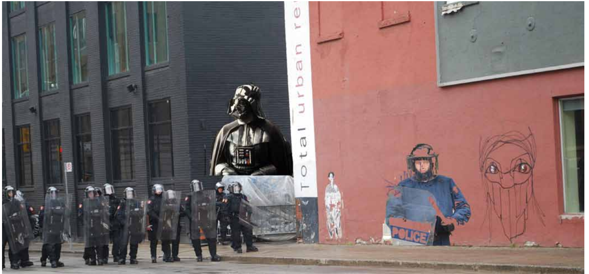
Walking in your footsteps