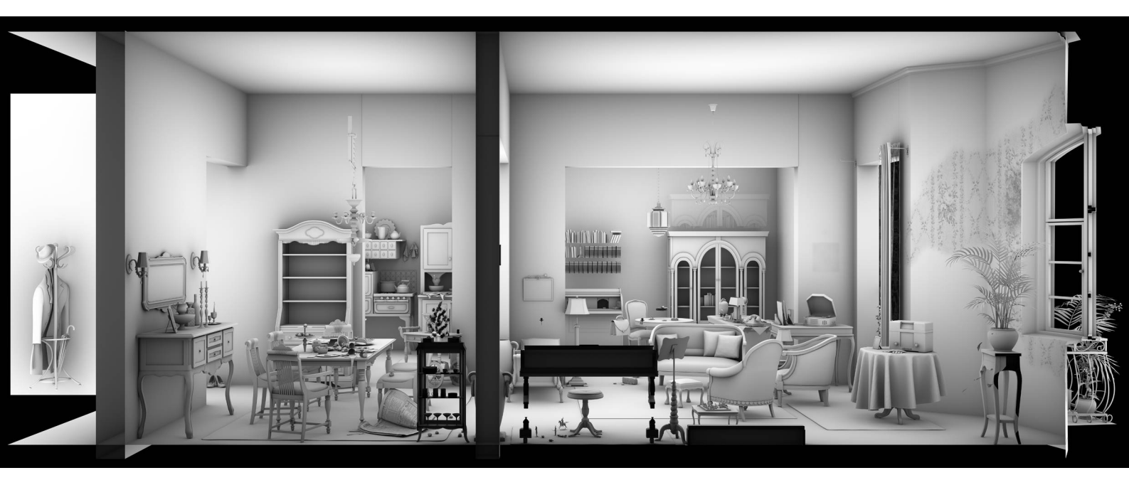
Living Room 2, computer visualization installation 2009-10