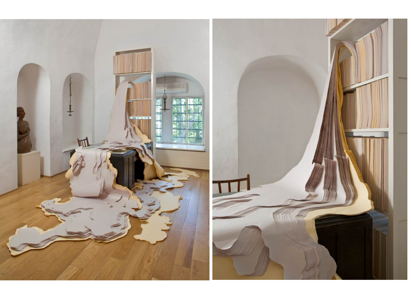
Paper Work, Paper installation, The Ticho house, Israel Museum 2009