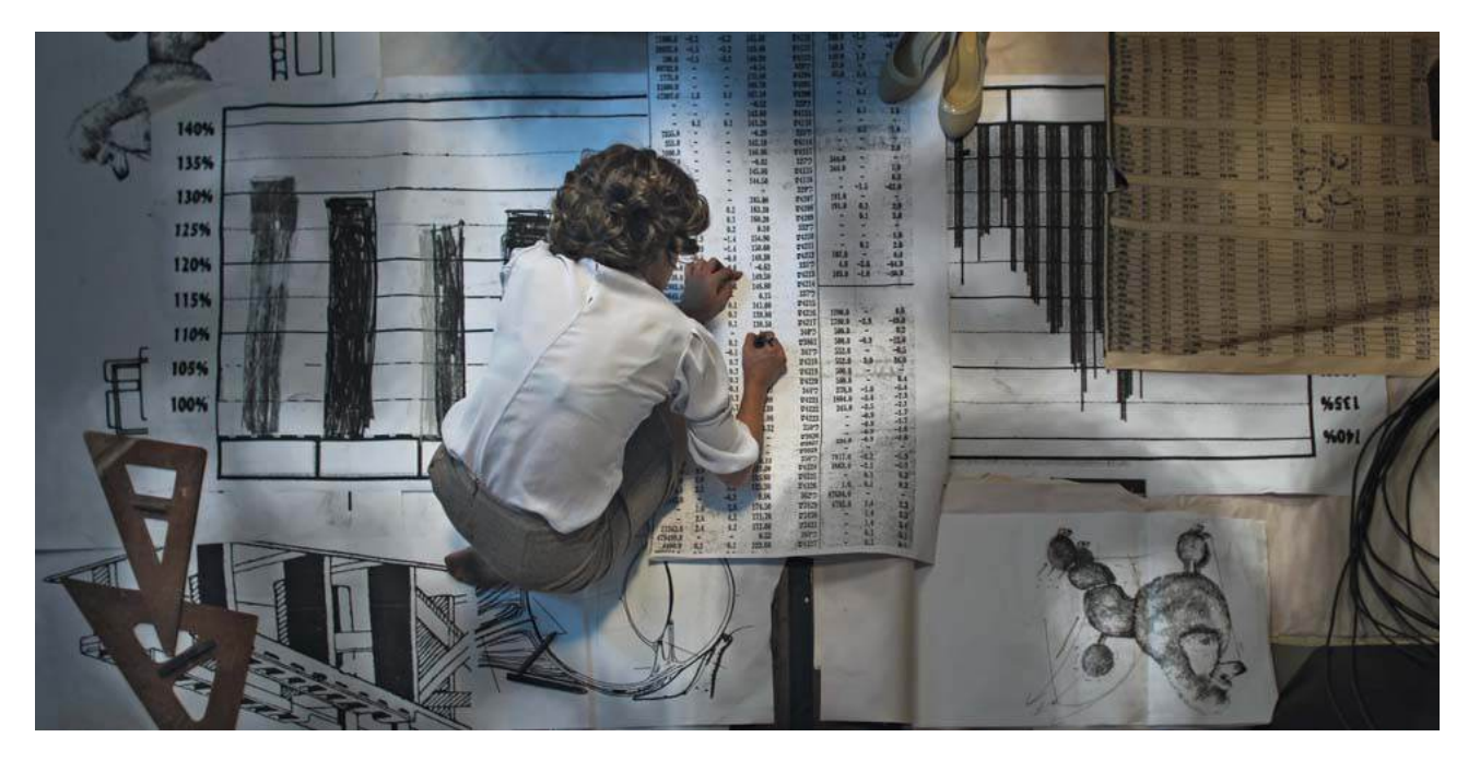
video stills from "Black and White Rule" 2011

The use of paper as a central material that adds up to a volume and a complete reality is present in all the above mentioned projects, and in particular - similar use of layers of paper can be seen in my sculpture "Paper Work".