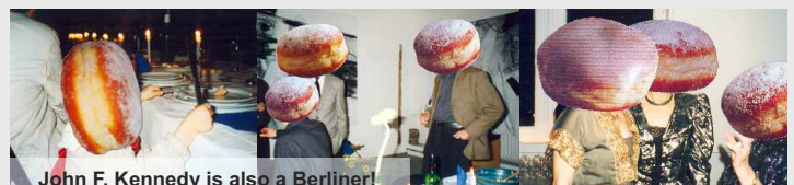
John F. Kennedy is also a Berliner!

Place a piece of dough in the middle of their heads, pull apart and press well together around the neck - let rise. Then dip the Berliners into a pot of very hot oil until they are golden brown and crisp.