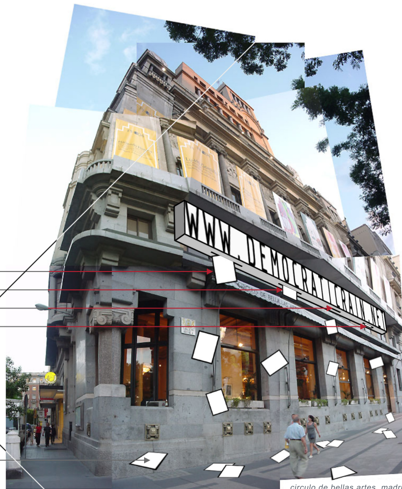
circulo de bellas artes, madrid