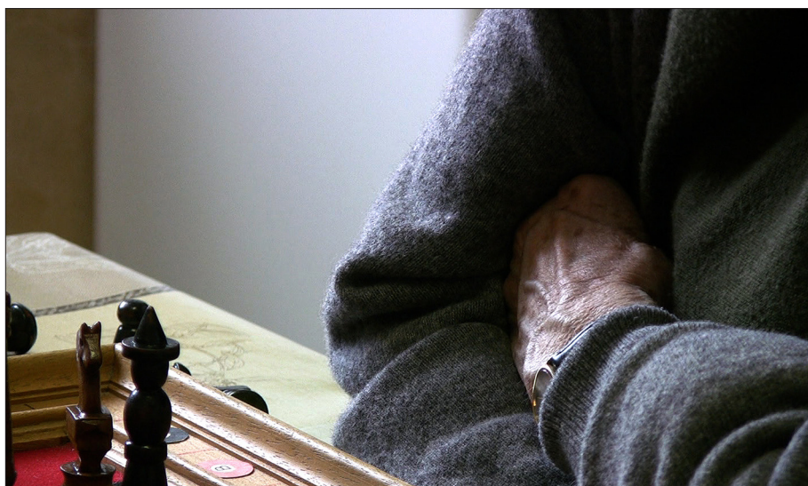
From top to bottom Fin' Amor , 2009 still from video