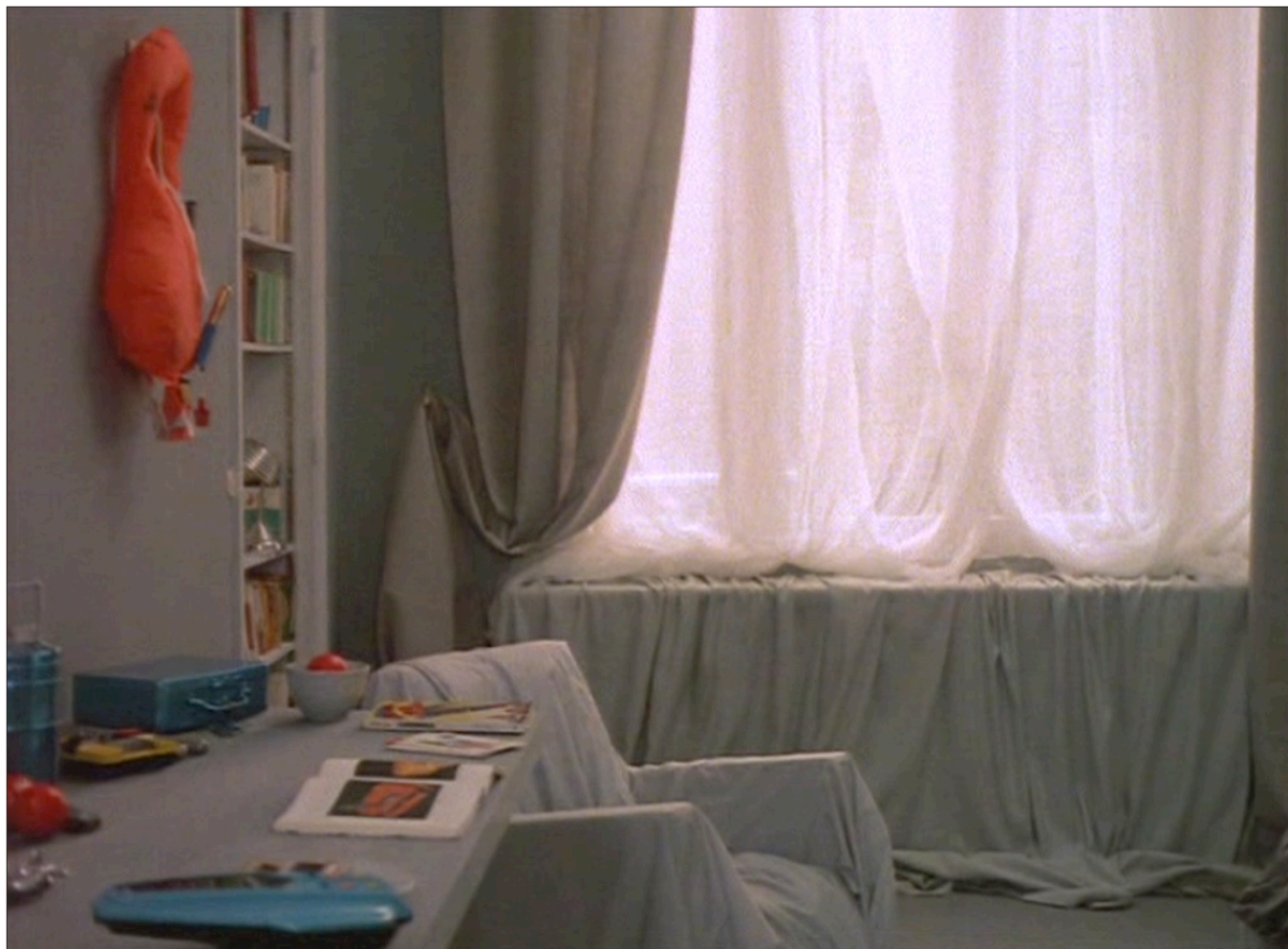
Eric Rohmer Full Moon in Paris 1984, still from film