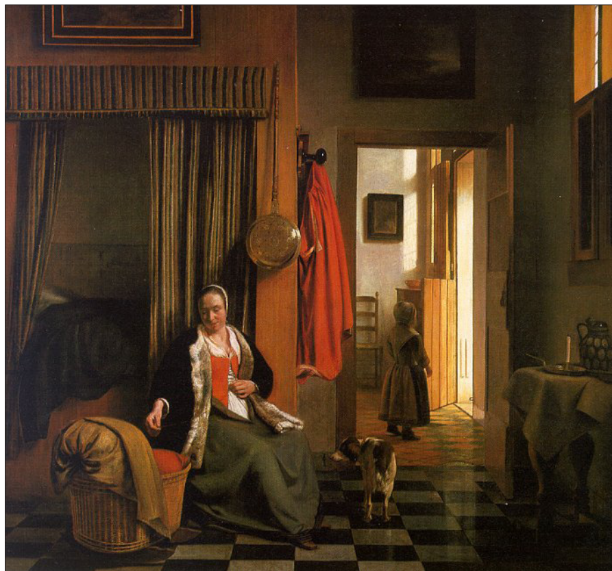
Pieter de Hooch The Mother 1659-60, Oil on canvas, 92 x 100 cm Gemäldegalerie, Berlin