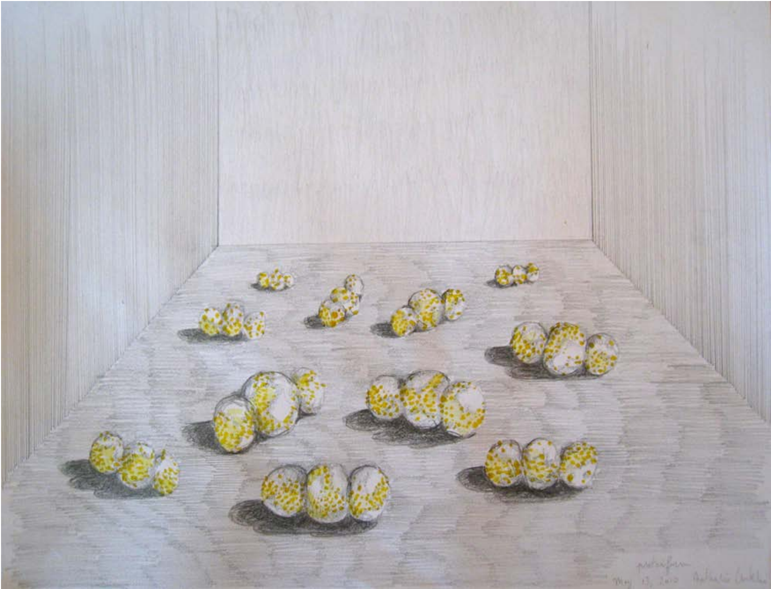
proteiform_2010_8.5x11 inches_graphite and markers on paper.