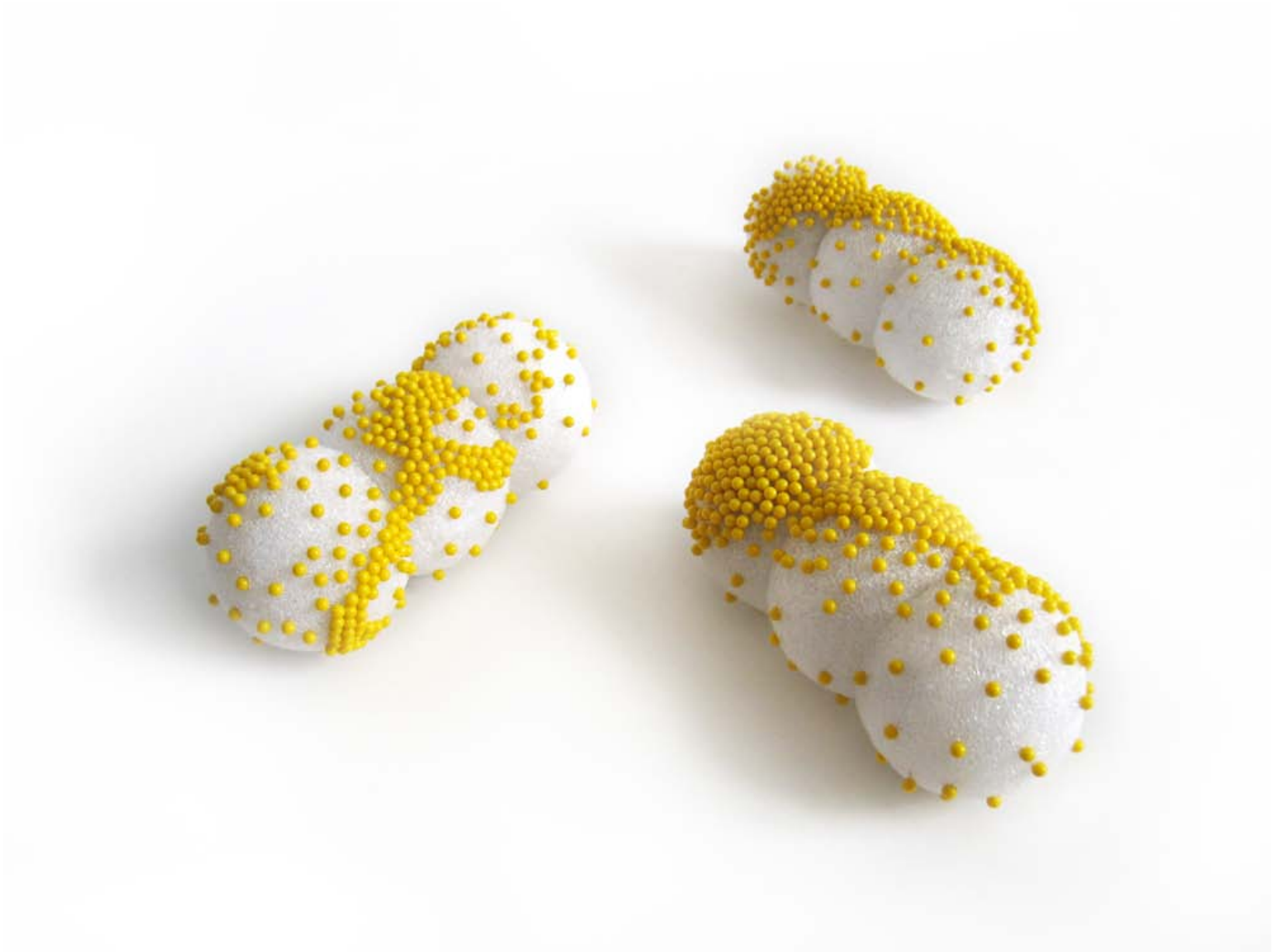
proteiform_2010_6 x 3.5x3.5 inches_yellow pins and styrofoam balls.